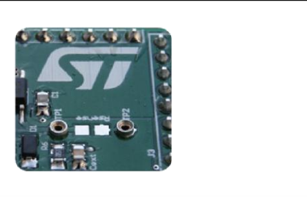
Figure 3: No sense resistor

Another option is soldering an SMD resistor on the dedicated PCB pad, as shown in Figure 5: "Pads for soldering SMD resistor" .